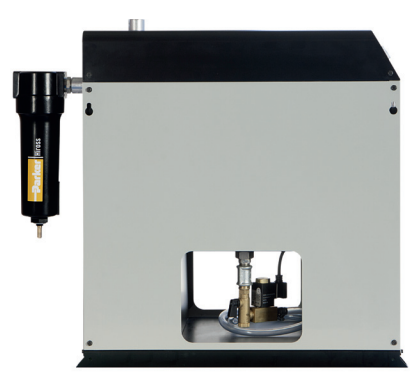
A pass-through drain niche allowes easy drain access from both sides