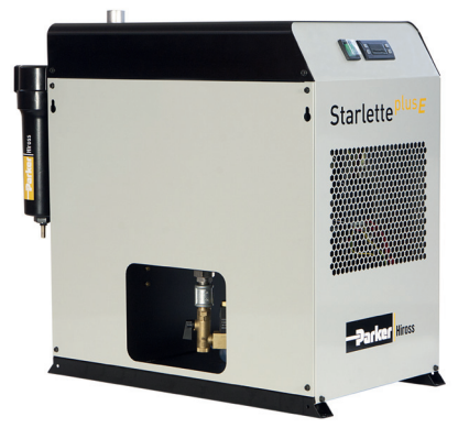
Equipped with digital controller